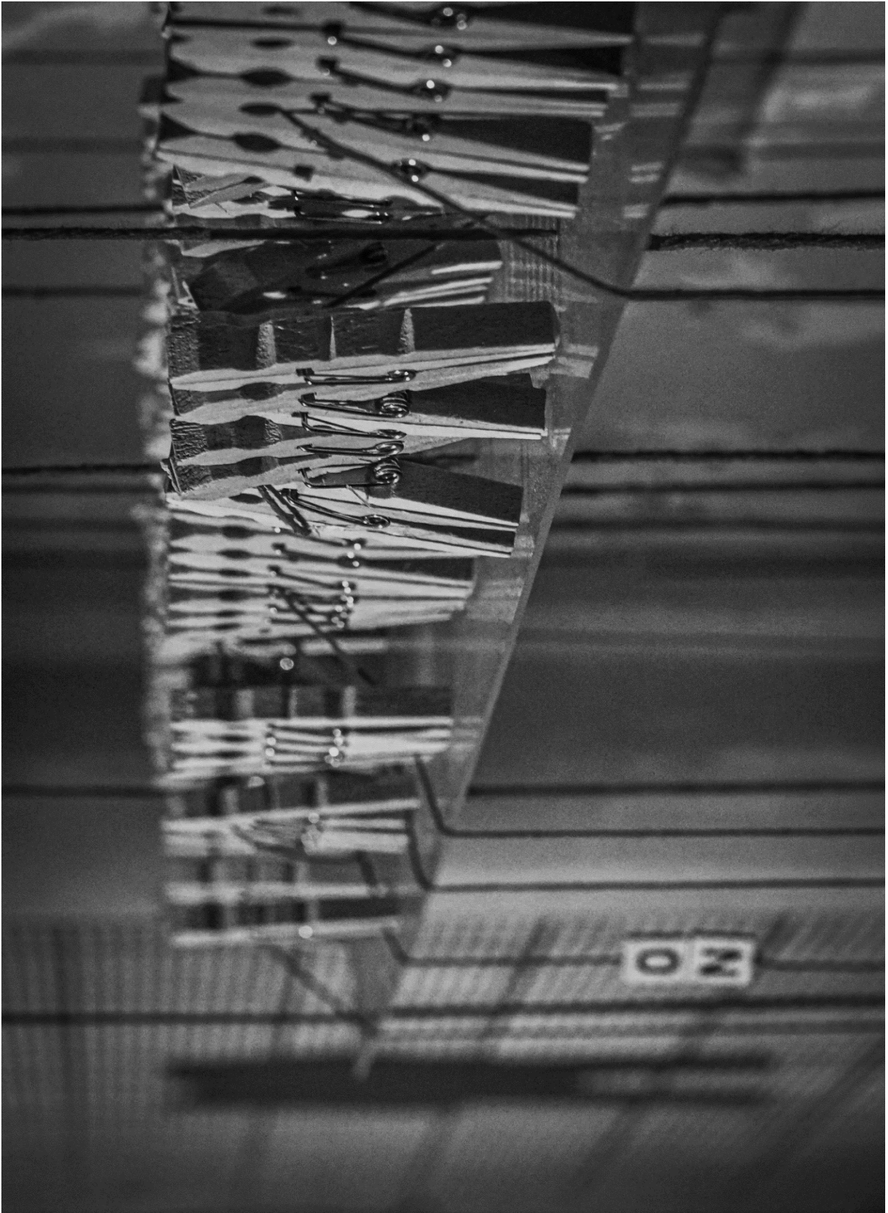
JUS SANGUINIS