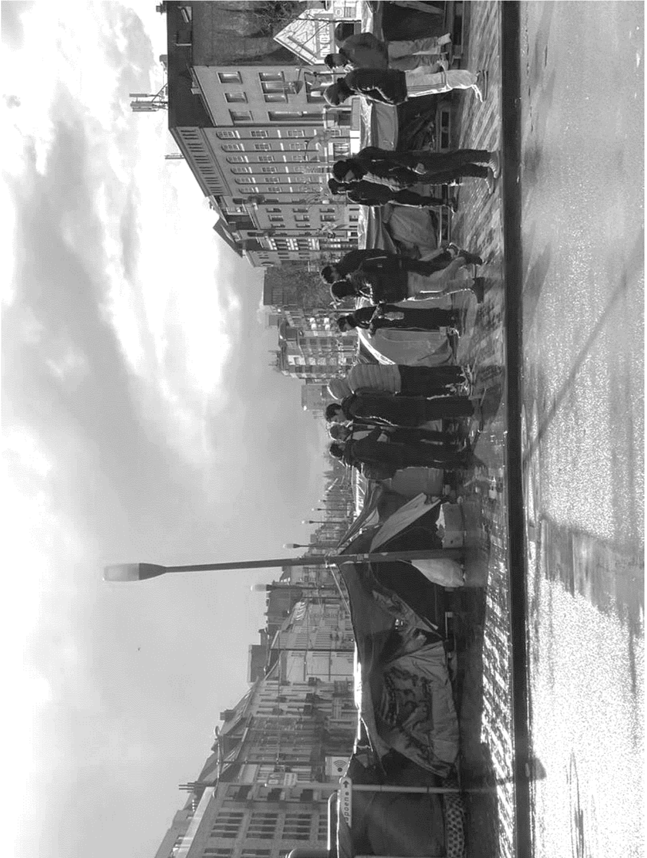
BRIDGE STORIES