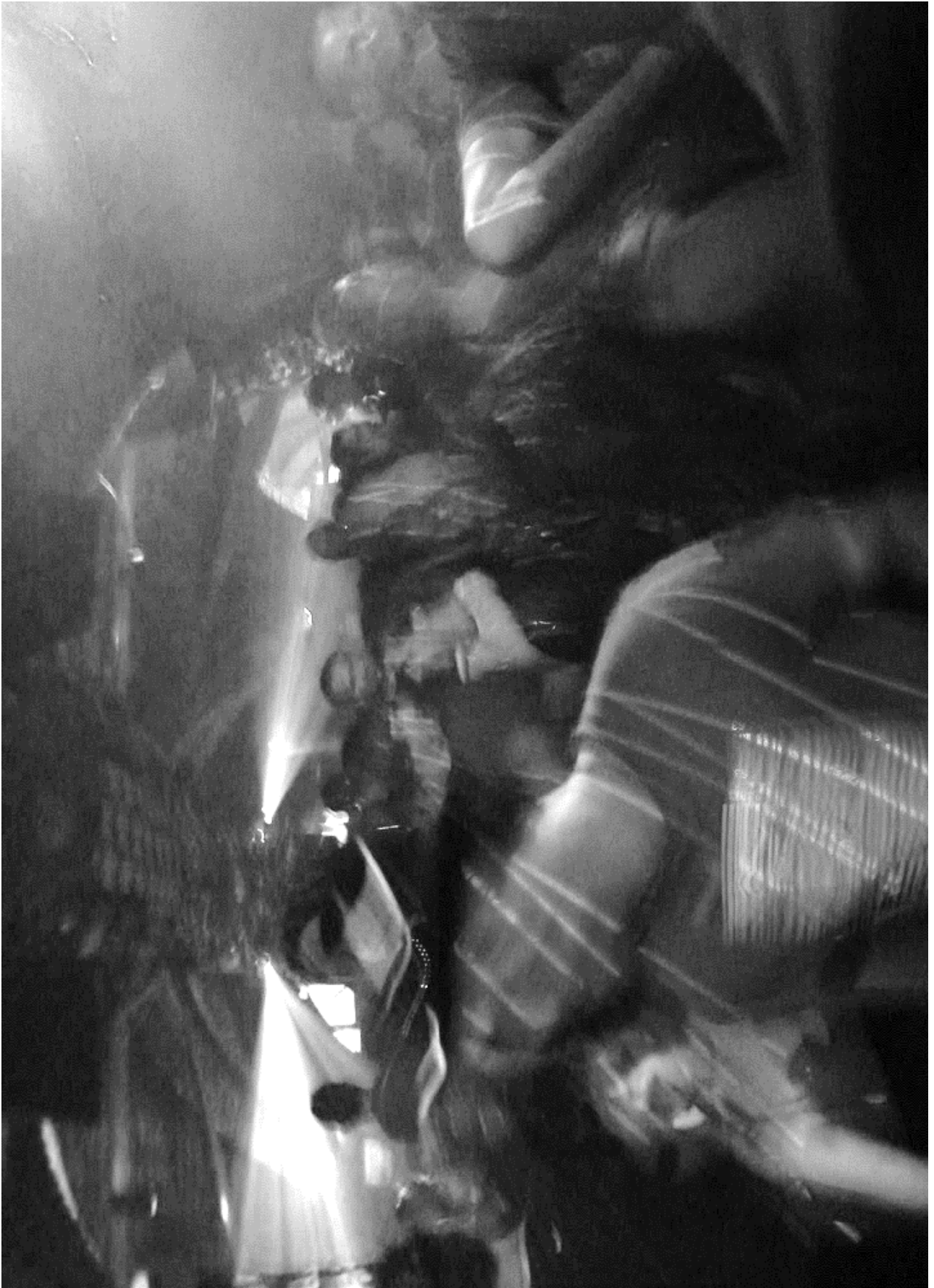
MIND THE NIGHT: LES NUITS DE DEMAIN