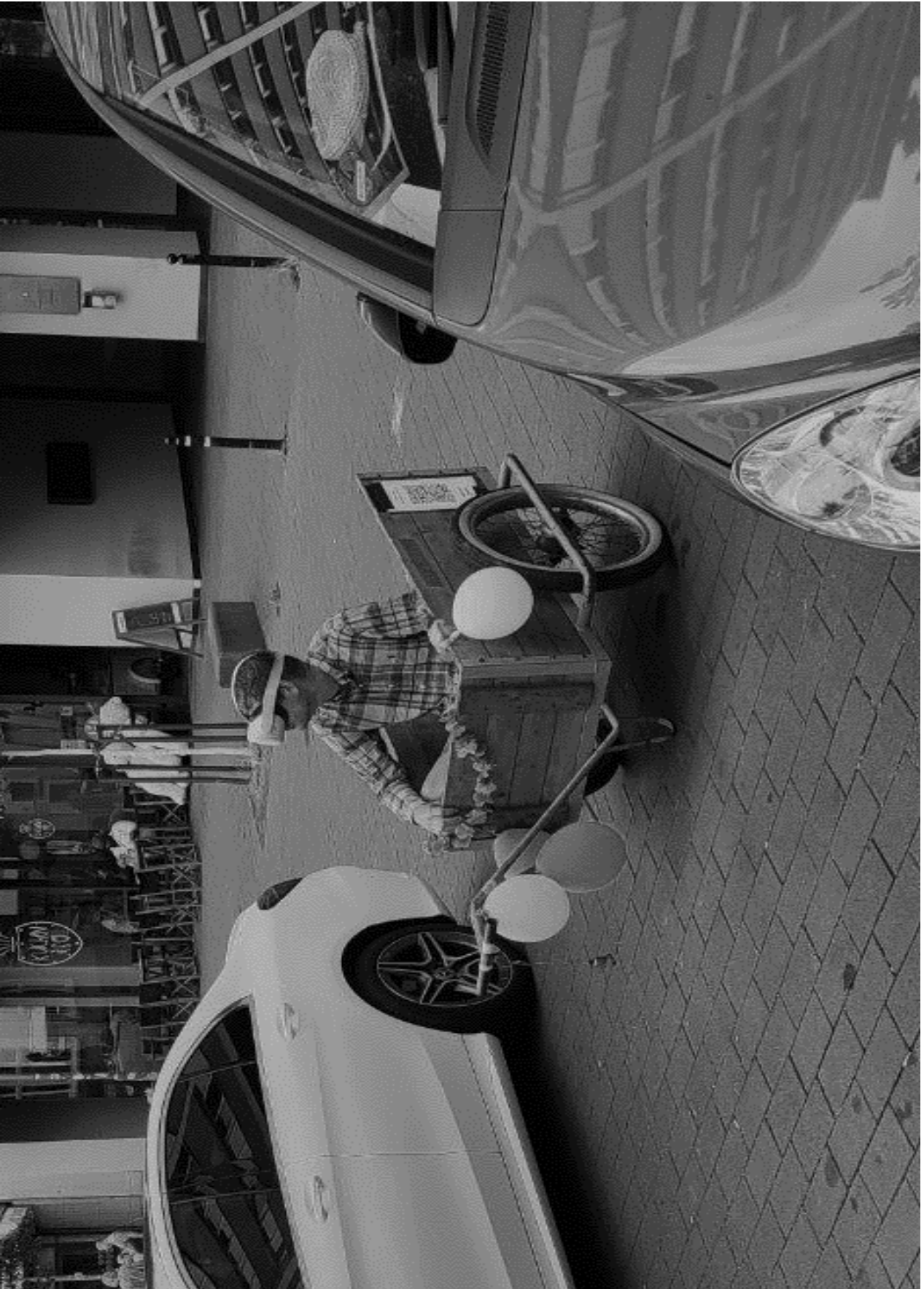
1984 IS NOW (picture: Zero)