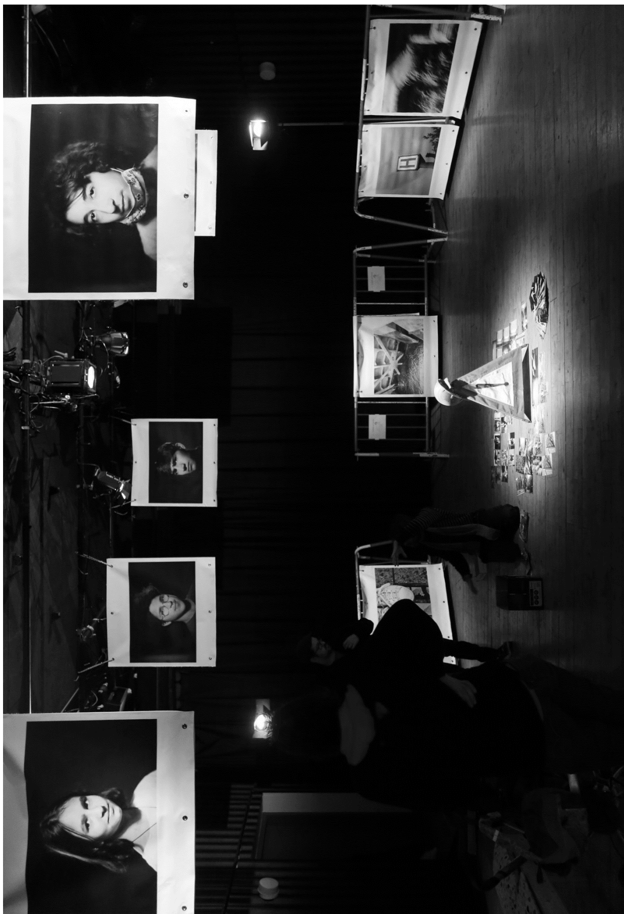
URBE URBANISME EMOTIONNEL