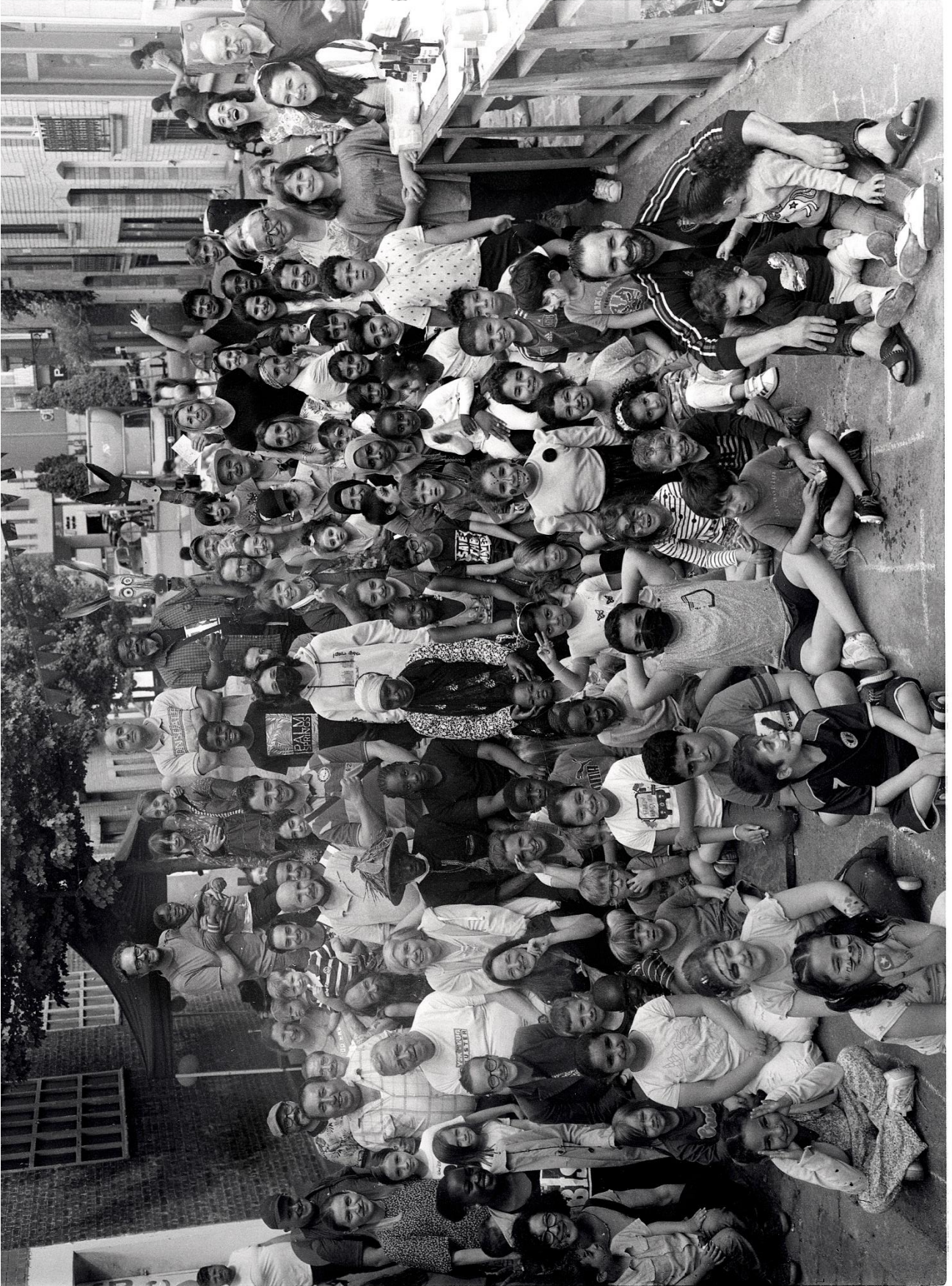
ARPENTAGE D'UN QUARTIER POPULAIRE (picture: collectif d'habitants Avanti Pogge)